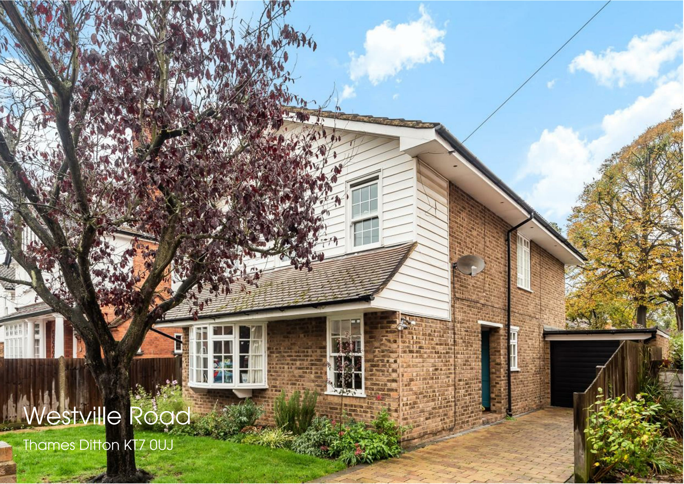
Westville Road Thames Ditton KT7 0UJ